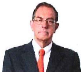
Jorge Avelino Braga de Macedo

He was born on 1st December 1946. He has a law degree from Universidade de Lisboa in 1971. At Yale University, he completed M.A. in International Relations (1973) and also has PhD in Economics (1979). He aggregated in the Faculty of Economics from Universidade de Lisboa in 1982. Since 1999 to 2004 he belonged to the Organisation for Economic Cooperation and Development (OECD) and the European Commission in Brussels between 1988 and 1991. At a national level, he was President of the Parliamentary Commission for European Affairs (1994-1995), and Minister of Finance (1991-1993). He has taught at the Centre Européen d'Education Permanente in Fontainebleau, and at the Catholic University of Lisbon, at Princeton University, among others. He has been a consultant at the European Bank for Reconstruction and Development, the United Nations, the World Bank and the International Monetary Fund. Currently, he is a Professor of Economics at Universidade Nova de Lisboa, teaches at the Institut d'Etudes Politiques (SciencesPo) in Paris, is Director of the Center Globalization and Governance (CG & G) at the Nova School of Business and Economics from the Universidade Nova de Lisboa, President of Institute of Tropical Research (IICT) and Member of the Board of Governors of the International Centre for International Governance Innovation in Waterloo, Canada. He was appointed member of the General and Supervisory Board of EDP and 20th February 2012.