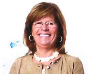
Maria Celeste Ferreira Lopes Cardona

She was born on 30th June 1951. She holds a Doctorate degree in law from the Faculdade de Direito da Universidade de Lisboa, having been an Assistant Professor in the same university. Within the Ministry of Finance, she was a member of the Fiscal Study Center and a Portuguese representative on the OECD. She was Minister of Justice of the XV Constitutional Government. She was graced the degree of Grande Oficial da Ordem do Infante D. Henrique, attributed in 1998, by his Excellency the President of the Portuguese Republic. She was also a non-executive Board Member of Caixa Geral de Depósitos. Mrs. Celeste Cardona published articles and opinions in specialty magazines, namely in "Ciência e Técnica Fiscal". She is also author of several monographs and varied studies, such as "As agências de regulação no Direito Comunitário", "O problema da retroactividade na lei fiscal e na Constituição", "A prescrição da obrigação tributária e a caducidade da liquidação de impostos", e "A natureza e o regime das empresas de serviço público". She is currently a lawyer and a consultant in M. Cardona Consulting, Unipessoal, Lda., and also a non-executive member of BCI, headquartered in Maputo, Mozambique, a member of the Fiscal Council of SIBS and a legal and fiscal consultant for several financial and non-financial institutions. She was appointed member of the General and Supervisory Board of EDP and 20th February 2012.